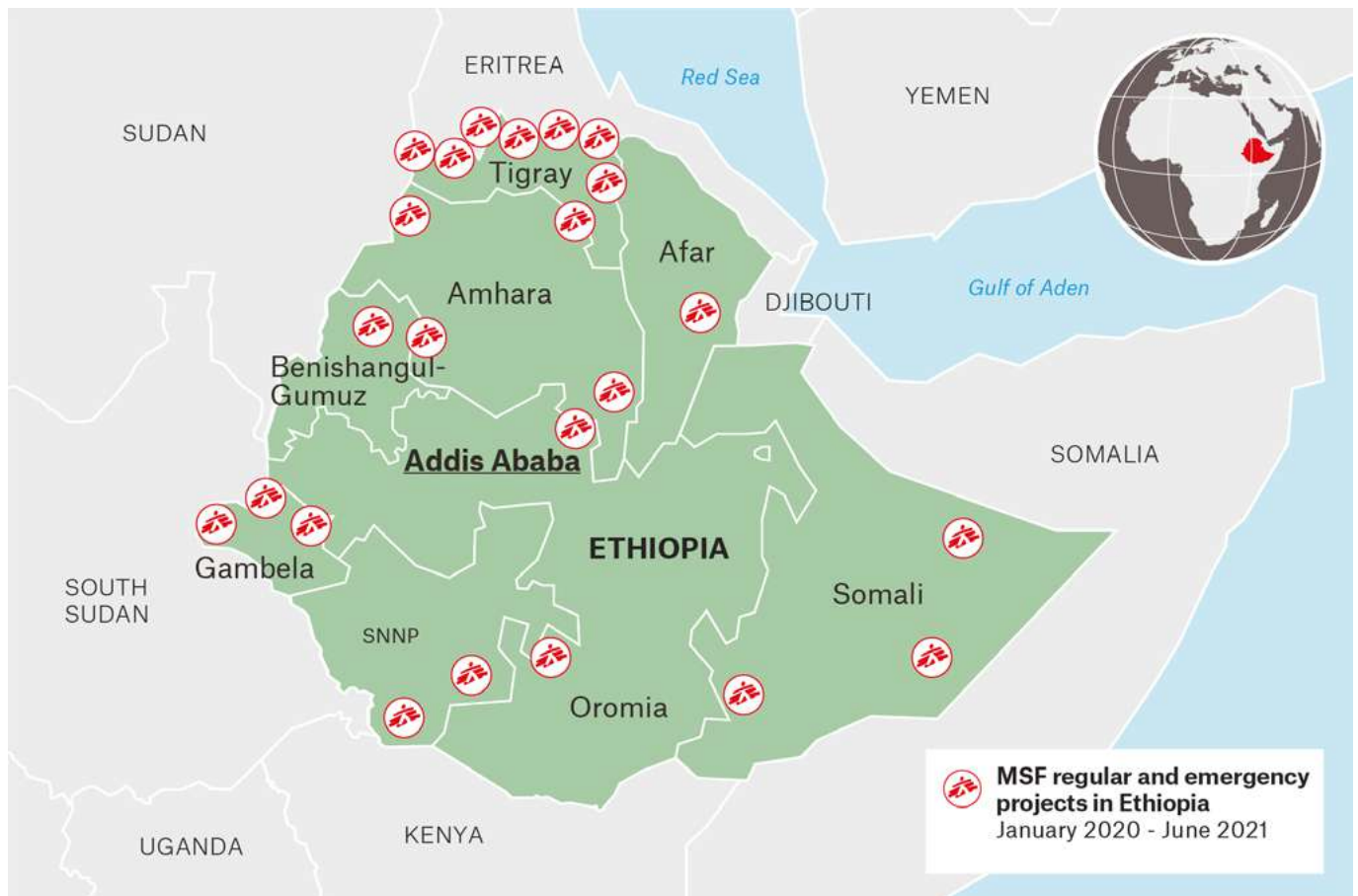
Image: Map of MSF's medical activities in Ethiopia January 2020 – June 2021