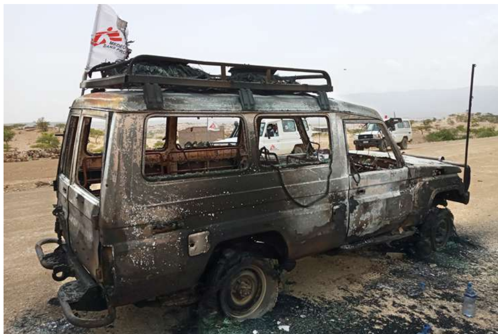
Image: Scene of the incident, showing the position and direction of the MSF car and the locations where the bodies of the three MSF staff and other civilians were found